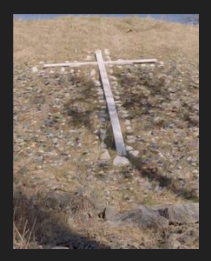
Memorial Cross on Hart Island, NYC to mark mass graves for AIDS casualties.

https://www.hiv.gov/hiv-basics/overview/history/hiv-and-aids-timeline